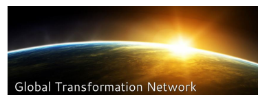
Global Transformation Network