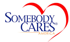
Somebody Cares America

Register by AUGUST 11 th to receive the EARLY BIRD RATE!