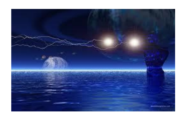
Day 2 - Genesis 1:6-8

6And God said, Let there be a firmament in the midst of the waters, and let it divide the waters from the waters.... 8And God called the firmament Heaven.