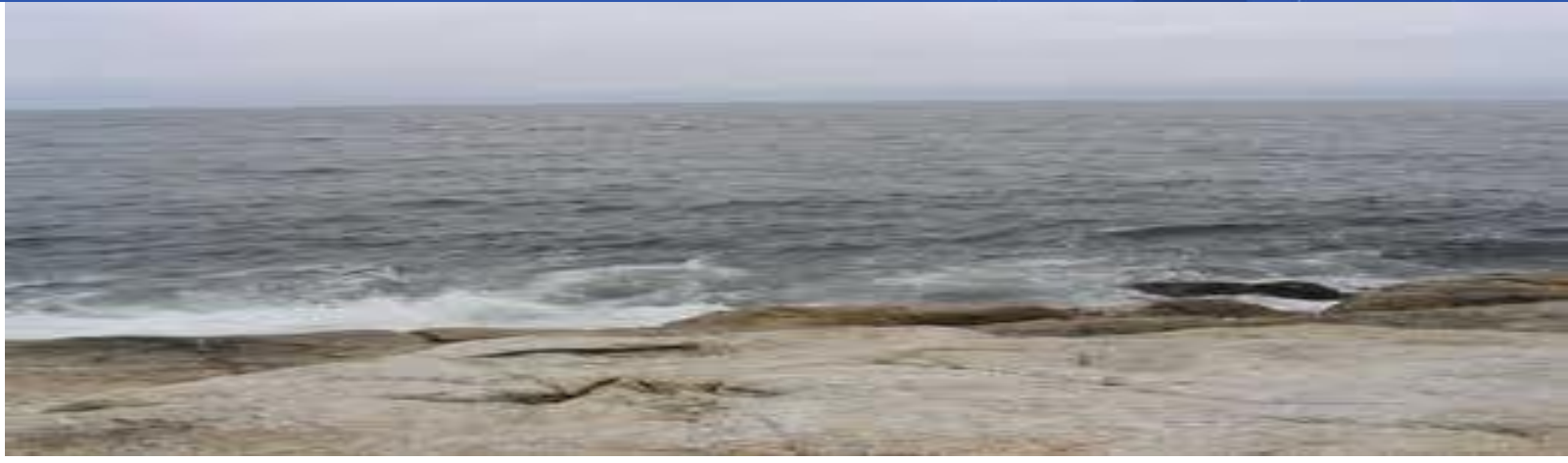
Day 3- Genesis 1:11

11And God said, Let the earth bring forth grass, the herb yielding seed, and the fruit tree yielding fruit after his kind, whose seed is in itself, upon the earth: and it was so.